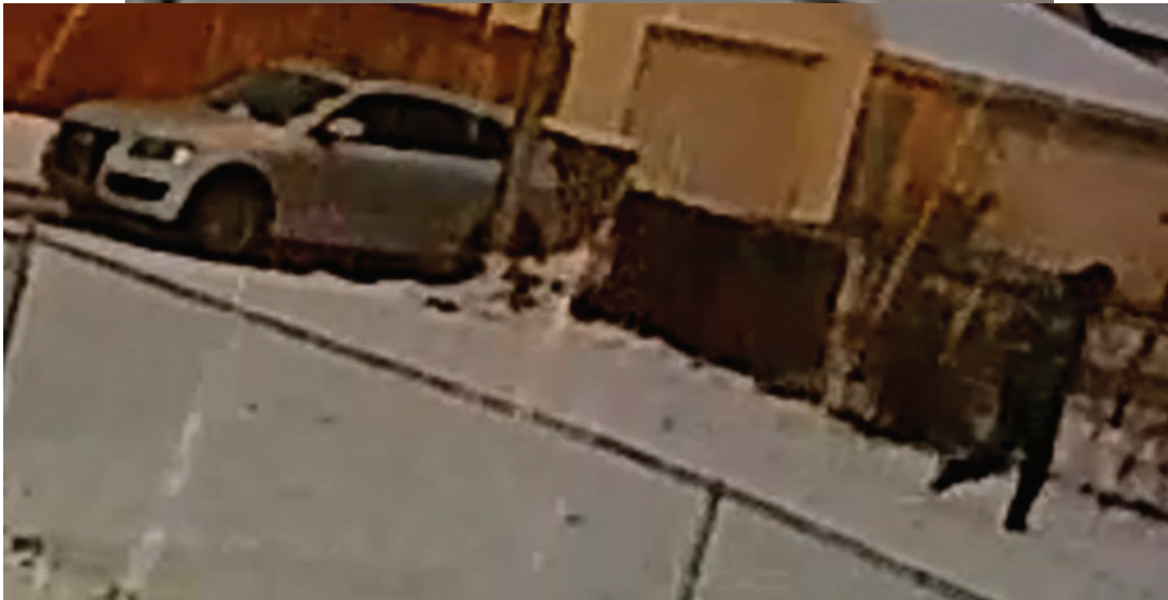
Surveillance video showing Suspect A on scene of homicide next to Target Vehicle.