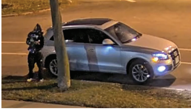
Target Vehicle and male individual on December 9, 2022, at 2:07 a.m. outside GRANTOSA.

31. Surveillance footage obtained from 8500 block of West Grantosa Drive showed the same male individual entering the Target Vehicle on December 9, 2022, at approximately 2:42 p.m. A review of the surveillance footage revealed this male individual, wearing a top/sweatshirt and dark colored pants that bear a resemblance to the top/sweatshirt and pants worn by Suspect A at the Subject Location on December 9, 2022. The male drives the Target Vehicle away and returns, at approximately 2:47 p.m., to the same area it was originally parked. At this time, a female subject who appears to be Shanelle McCoy, exits the front door of her residence located at GRANTOSA. McCoy enters the front passenger seat of the Target Vehicle, and the vehicle is driven away out of view of the surveillance cameras. The historical phone record data for Subject Phone 1 and Subject Phone 2 was consistent with the phones being in the same area as the Target Vehicle which is further reflected in the surveillance footage outside GRANTOSA on December 9, 2022.