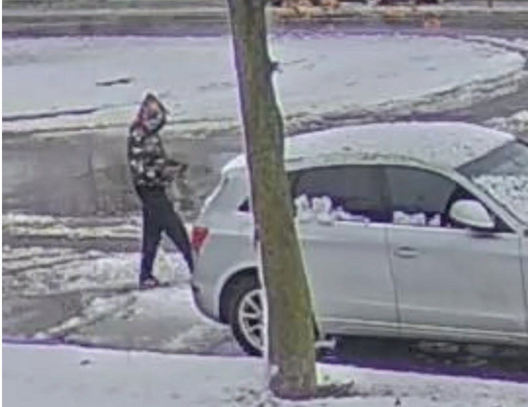
Male individual approaching driver's area of Target Vehicle on December 9, 2022 at 2:42 p.m. outside GRANTOSA